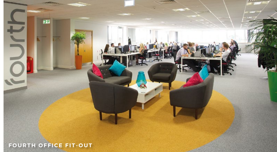
FOURTH OFFICE FIT-OUT